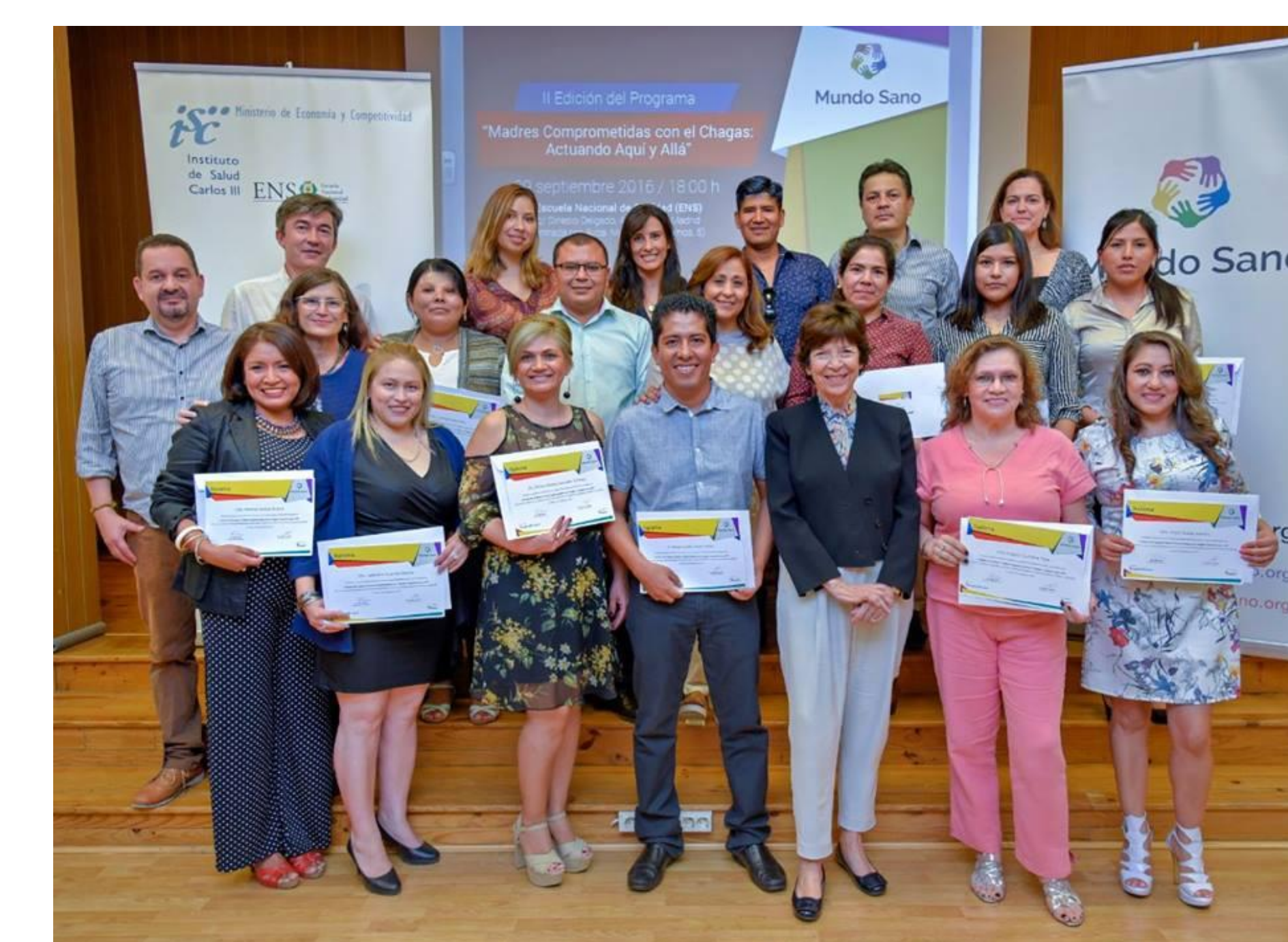
The new 14 CHW specialized in Chagas disease receiving their certificates in Madrid. September 2016.