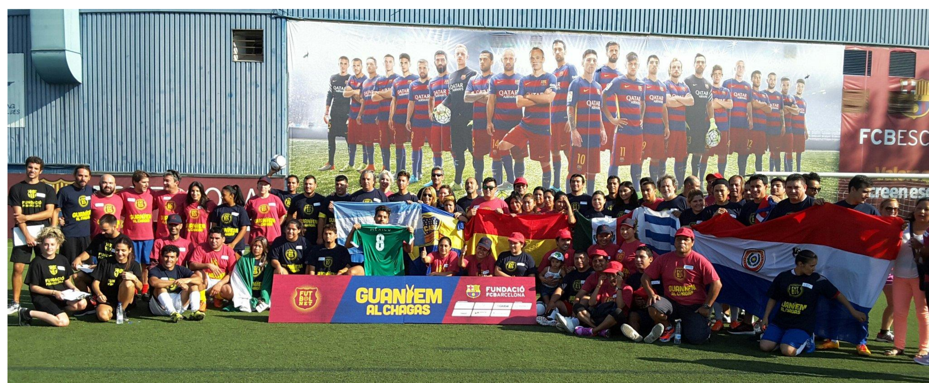
Playing soccer for beating Chagas disease in FC Barcelona's facilities: patients' associations, health professionals and latino community. Barcelona, 4th September 2016.